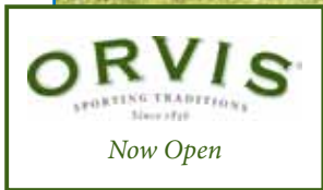
7000 Wisconsin Avenue