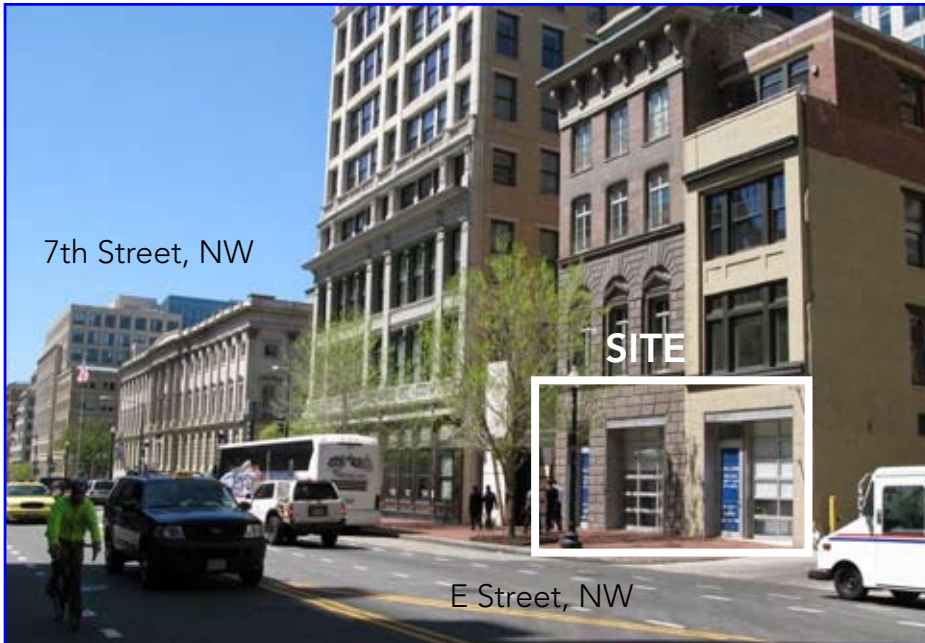
625-627 E Street, NW