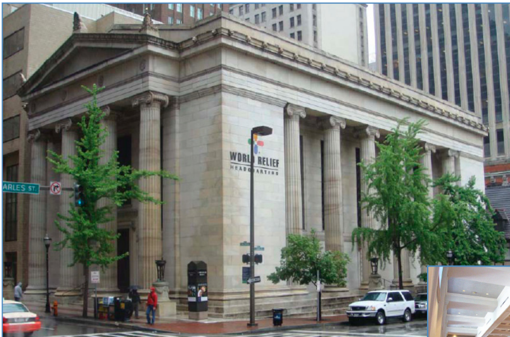
1 East Baltimore Street