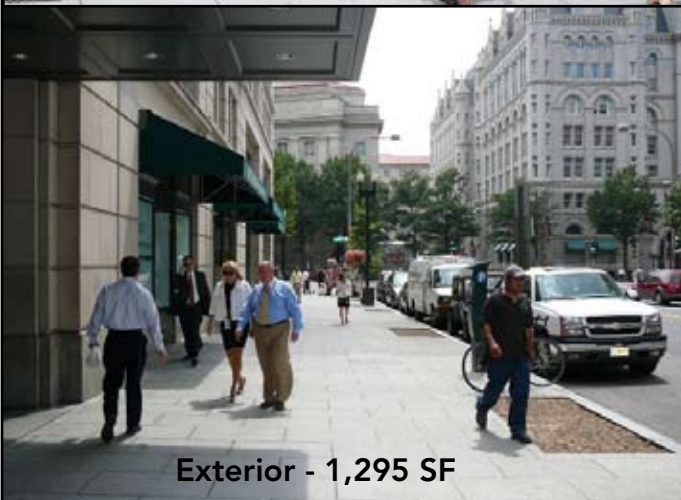
Exterior - 1,295 SF