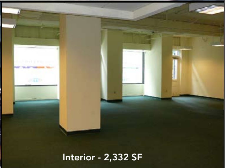
Interior - 2,332 SF